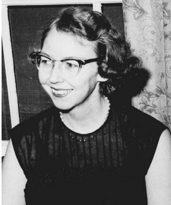
Flannery O'Connor

writes about the unfortunate distinctions he sees between the culture of the South before to the Civil War and Reconstruction, and afterward: