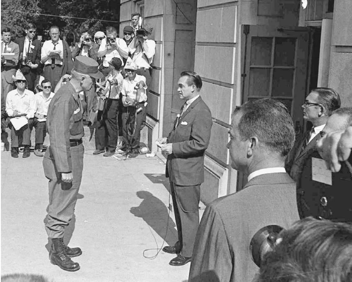
Governor George Wallace blocking the entrance to the University of Alabama

Rights-era readers to reject the racial status quo, so she presented them with a mythic figure of the recent past to show them the way. If a reader in the 1960s thought, “I wish I could question segregation, but that simply isn’t done,” To Kill a Mockingbird offered a blueprint of the way it might be done, if one were brave enough.