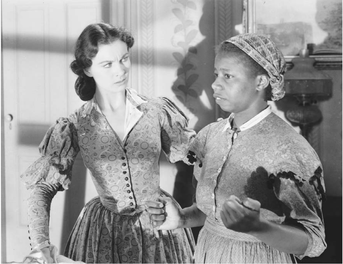
Vivien Leigh and Butterfly McQueen in a scene from Gone With the Wind

argument for retaining the traditions and institutions inherent to the South. “The Agrarians,” as the writers would come to be known, feel that industrialization made good, honest, hard work monotonous, which dehumanized the endeavor, turning purposeful labor into servile monotony.